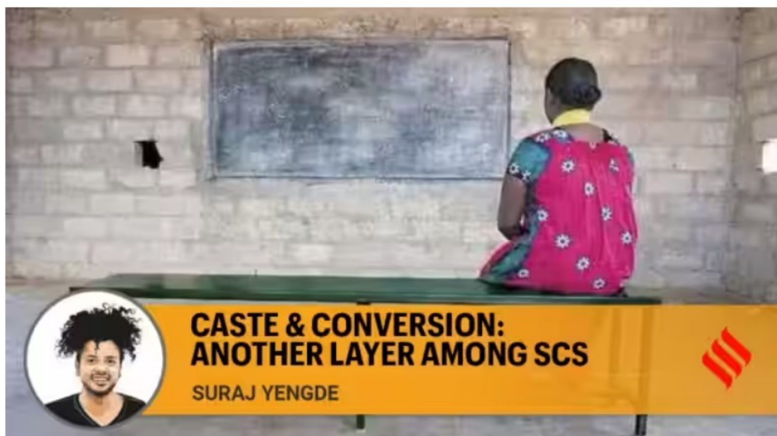
By claiming the SC status, have the Abrahamic Dalits realised the mistake of their ancestors, that is, the commonality of Dalits across the faith is their subjugation?